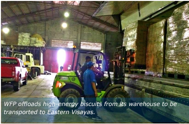
WFP offloads high-energy biscuits from its warehouse to be transported to Eastern Visayas.