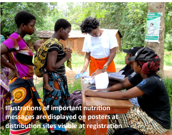
Illustrations of important nutrition messages are displayed on posters at distribution sites visible at registration

Slight delays that pushed some distributions of assistance into early March were due to food supply challenges, poor road conditions in some districts that created access problems, and the need to create additional cash distribution sites in the northern region to reduce waiting times and travel distances.