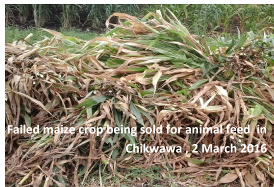
Failed maize crop being sold for animal feed in Chikwawa, 2 March 2016

In February, rainfall in Malawi improved in northern/central districts with moderate to heavy rainfall recorded —though in many areas this erratic rain comes too late for proper crop development. Southern Malawi generally continued to experience low rainfall, with eight southern districts now considered to be at risk for extreme drought. Given the expected low rainfall for the rest of the season, central and southern Malawi are projected to experience poor and failed crops (see map).