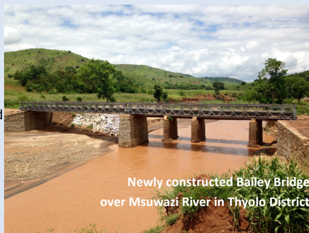
Newly constructed Bailey Bridge over Msuwazi River in Thyolo District

A bailey bridge is a portable type of bridge made up of three main parts - floor, stringers and side panels - that can be erected without use of specialised tools or heavy machinery. Once completed, these bridges will reopen critical routes for communities to access markets and services, as well as guarantee quick access for WFP and others needing to reach vulnerable areas.