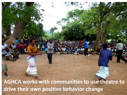
AGHCA works with communities to use theatre to drive their own positive behavior change

To ensure the maintenance and return of sustainable livelihoods and support a systematic transition from humanitarian relief to recovery and development activities, WFP continues to work with partners to implement a range of complementary activities to build community resilience. These activities have been designed to be non-labour intensive and not to distract people from core agricultural activities. Successes of these efforts to date