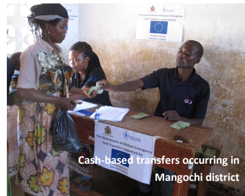
Cash-based transfers occurring in Mangochi district

For February, WFP has so far reached more than 1.7 million people including 1.3 million with in-kind food assistance and 413,000 with cash-based transfers.* Due to funding constraints, pulses remained at a reduced ration (6 vs. 10 kg) for the fifth month in a row, while Super Cereal also had to be reduced from 6 kgs to 4.5 kgs, putting in jeopardy nutrition status of women and children. Meanwhile, some 1,600 people in Chikwawa district continued to benefit from e-payments, a delivery platform using a card-based system with Standard Bank.