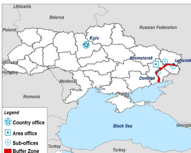
Emergency Operation 20076: Emergency assistance to civilians affected by the conflict in eastern Ukraine