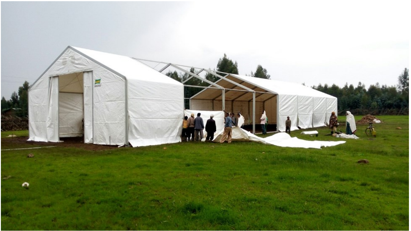
MSU under erection in Meket, Amhara Region