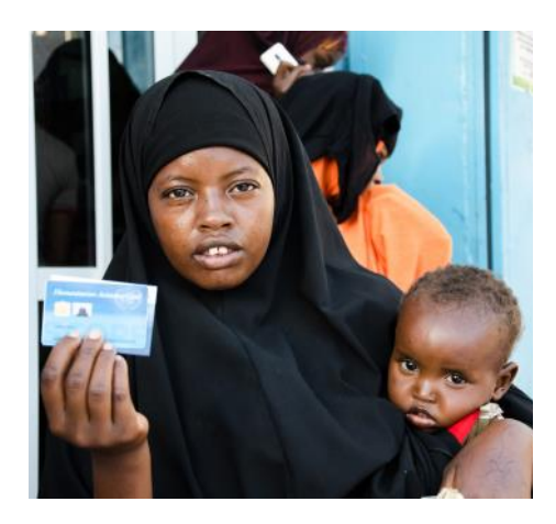
NRC staff distribute WFP-developed smartcards to vocational training participants in Somalia.

In 2015, NRC deployed 53 personnel to WFP, the highest of all WFP's 22 stand-by partners. Many NRC personnel assisted WFP operations in response to Ebola in West Africa and for the Nepal earthquake. NRC manage the ProCap, GenCap and CashCAP rosters, which deploy high level (P5/D1) experts in Protection, Gender, and Cash-Based-Transfers to UN agencies around the globe.