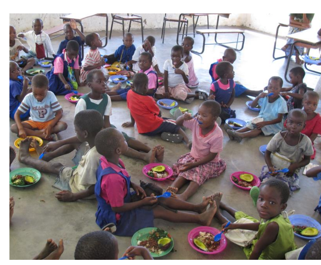
Primary school children enjoy variety in their home-grown lunches (courtesy of local farmers) in a joint WFP/UNICEF/UNFPA Education Project.

Crucial support from Norway and other donors complement the Ethiopian government's contribution towards relief efforts. In-kind contributions such as cereals, pulses, vegetable oil and SuperCereal, a fortified high-protein blend, provide immediate food assistance to vulnerable people. These rations help stabilize malnutrition rates, which have risen because of the drought. Cash contributions are critical to WFP's extension of life-saving food assistance throughout the year.