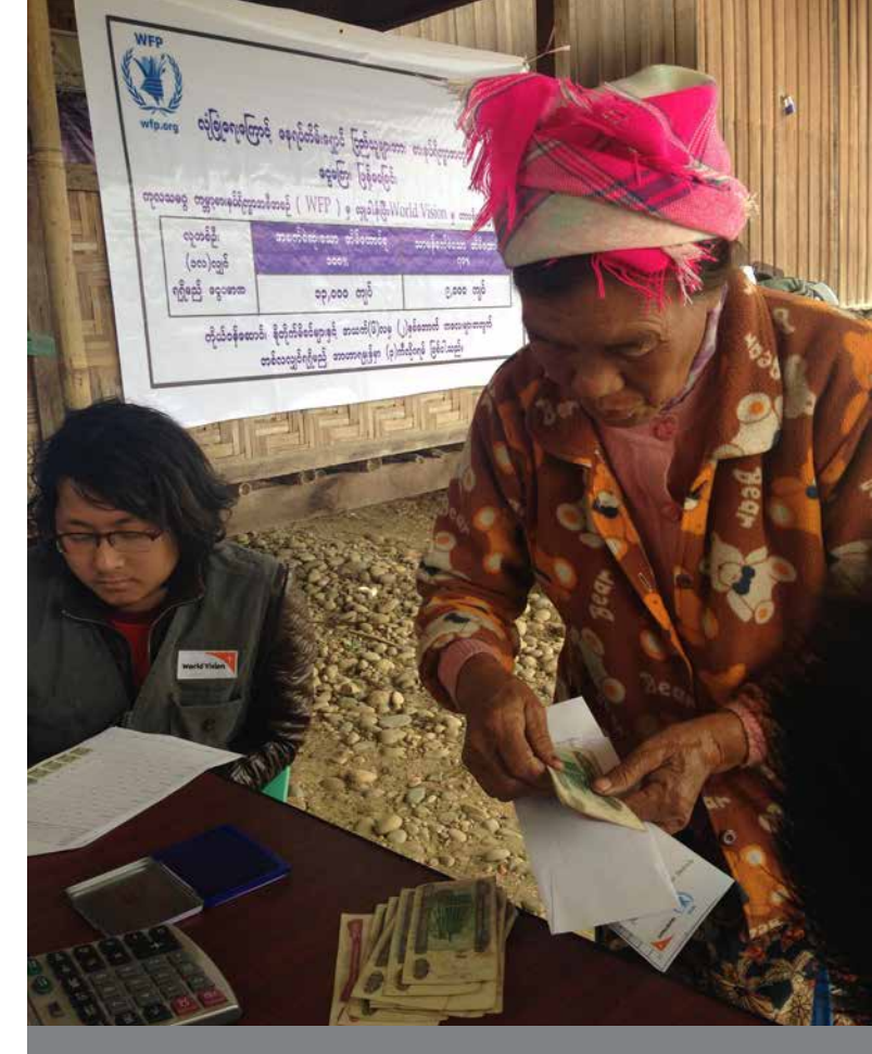
A displaced women collecting cash assistance from World Vision and WFP in Thagara Lisu Camp, Kachin State, Myanmar.

WFP partners with more than 1,000 communitybased organizations worldwide. Many of them have a faith-inspired mission. This illustrative list of joint activities demonstrates the diversity of partnerships that WFP has developed with various types of faith groups across different regions, hunger contexts, programme activities and transfer modalities. The stories also reveal the mutual benefits of collaboration between faith-inspired organizations and WFP and the complementarity among local, national and international partners. Such partnerships and complementarities enable us to jointly mobilize the necessary attention and resources to save lives and build the resilience of people and communities.