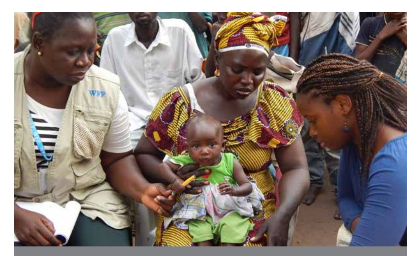
WFP, CARITAS and EU joint visit to the Mores Health Center in the Oio region, Guinea-Bissau.

The Adventist Development and Relief Agency (ADRA) and WFP started joint programmes in eastern Ukraine at the start of the conflict in 2014. Together, they distributed food to 135,000 vulnerable people affected by the conflict. WFP and ADRA work hand in hand to reach the most vulnerable people and provide them with food or cash-based transfers in areas where markets are functioning well. Since 2015, WFP and ADRA have also supported food-insecure individuals in hospitals and social institutions with monthly food assistance.