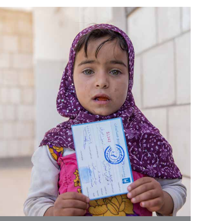
A girl with a coupon from a Islamic Relief and WFP emergency food assistance project in Sana'a, Yemen.

The partnership between the Aga Khan Foundation and WFP in the Syrian Arab Republic currently benefits 60,000 people each month, including 6,000 children supported through a nutrition programme, and 1,200 children assisted through a school snack programme. The Aga Khan Foundation has recently implemented WFP livelihood projects in the Syrian Arab Republic that strengthen the local food production and processing systems and create local employment opportunities.