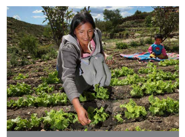
A woman works in a garden with her child near the village of Jatun Mayu, Plurinational State of Bolivia. <u> </u>