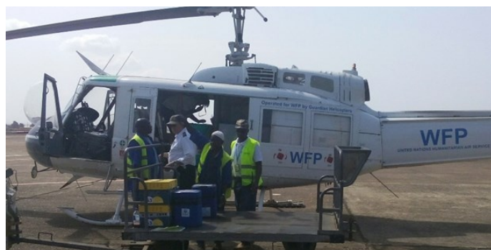
UNHAS transports medical supplies to assist the humanitarian response to the most recent Ebola flare-up in March and April 2016.