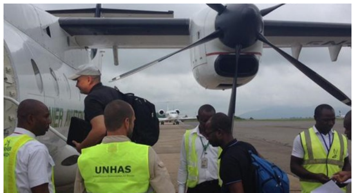
UNHAS transports UNHCR passengers from Abuja to allow them to reach their project implementation sites.

- In response to the increasing needs of humanitarian organizations in Nigeria to improve the access to conflict-affected areas in the North East, UNHAS performed a two-day assessment mission in May to Baga, Bama, Banki and Monguno using a helicopter.