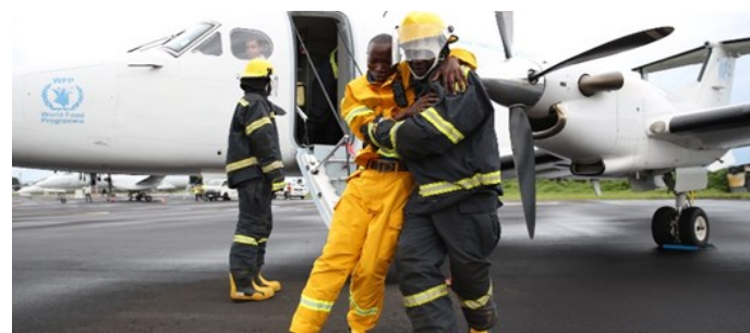
UNHAS, MONUSCO and Goma's Airport Medical Services run a drill for Emergency Crash and Rescue Services (ERC) live exercise.