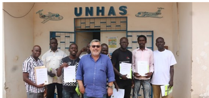
UNHAS' partners ASF-F, ICRC and MSF work together to organize Dangerous Goods training for 44 staff members in Bangui in April.

- With increased needs, the UNHAS fleet has permanently been augmented to four aircraft thereby increasing the number of destinations from 21 in 2015 to 27 in 2016.