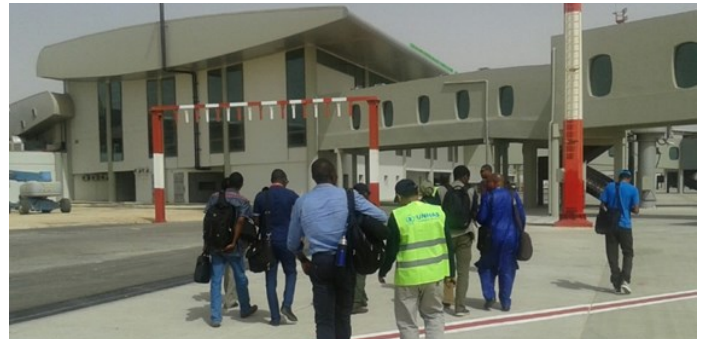
UNHAS passengers arrive at the new Nouakchott International Airport in Mauritania.

- The Mauritanian government constructed a new airport in Nouakchott from which it now operates its fixed-wing aircraft. The new Nouakchott International Airport, which opened on 23 June, is located 32 km from the city and ensures a high level of service with stable traffic conditions.