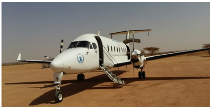
Ready to go! A fixed-wing aircraft in Kidal awaits to transport aid workers back to the capital.

- Previously, the presence of improvised explosive devices (IEDs) near the airfield of Kidal hampered UNHAS activities. Following the completion of demining operations of the airfield in late 2015, UNHAS was able to perform its reconnaissance flight on 5 February and air passenger services resumed shortly after, on 11 February. The reopening of the airfield was critical to the humanitarian community, enabling them to increase presence in the region and maximize their project implementation. UNHAS was able to perform nine flights before, due to a demonstration in Kidal on 18 April, the airstrip had to be closed again until further notice.