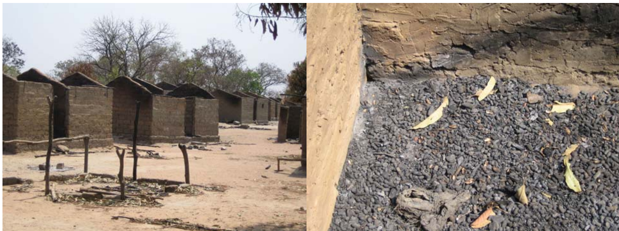
Coumpo Site, Paoa, after the attack at the end of January 2007: burned houses and groundnuts

Political instability and village attacks by bandits, rebels and military men are the main causes of food insecurity. Between 1996 and 2002, six coups d'Etat took place. The 2002-03 rebellion led to the installation of a new president and democratic elections in 2005. However, various new rebel groups emerged in 2005, attacking major towns such as Paoa and Birao and expanding their geographical control. The military responded by attacking rebel strongholds and burning more than 100 villages. Incursions from Chadian bandits and armed forces added to the violence. A substantial part of the area is controlled by rebels, whereas other parts are left to the mercy of bandits.