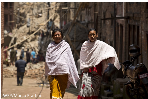
Women walk amongst the rubble and destruction in the ancient area of Bhaktapur.