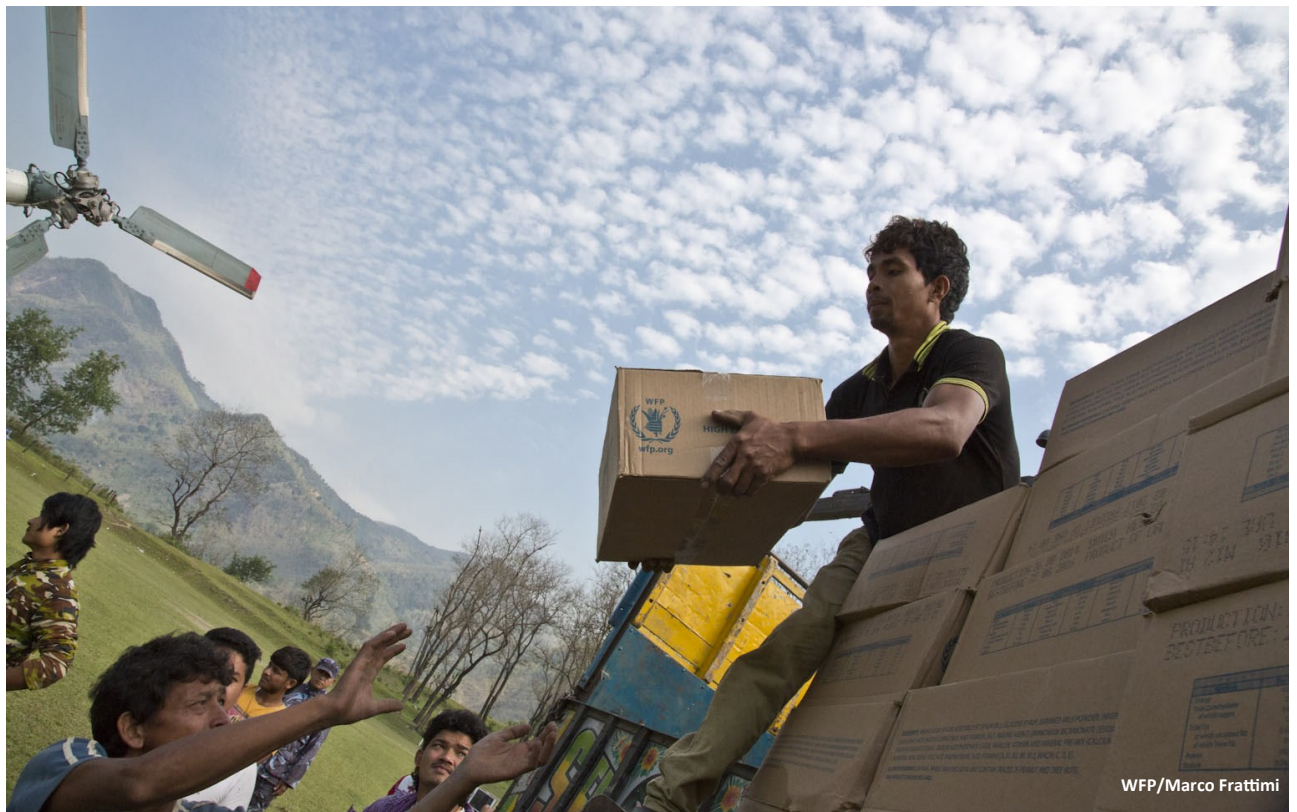
WFP distribution of High Energy Biscuits in Kerauja, Gorkha district.