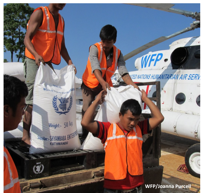
Loading up the helicopter with rice and supplies at the WFP logistics hub in Chautara.