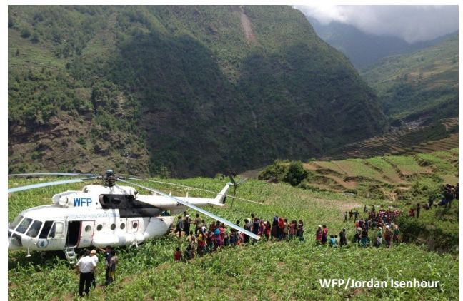
Dropping off supplies to Bolde, Sindhupalchok district.