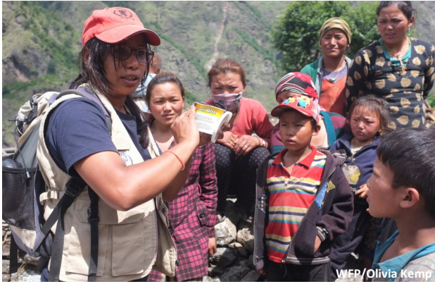
WFP staff speaking to villagers in Sindhupalchok about Plumpy'doz, a nutrition product for the prevention of acute malnutrition for children aged 6-59 months.