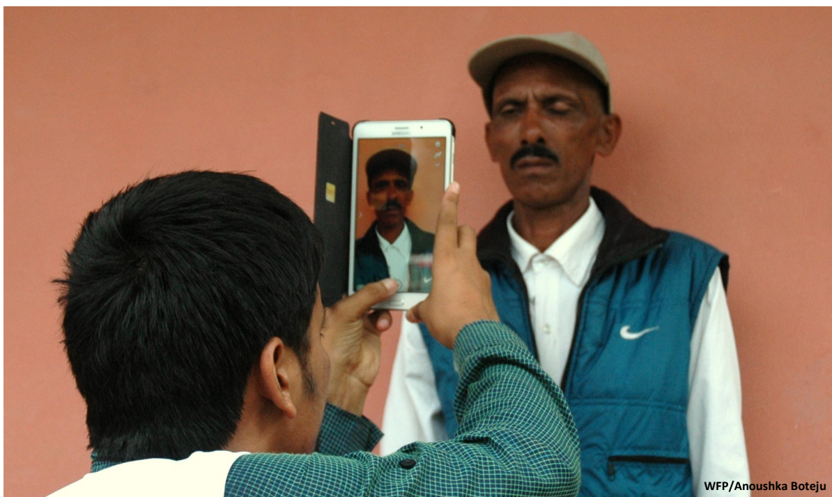
Photo registration for recipients of the cash for work programme.