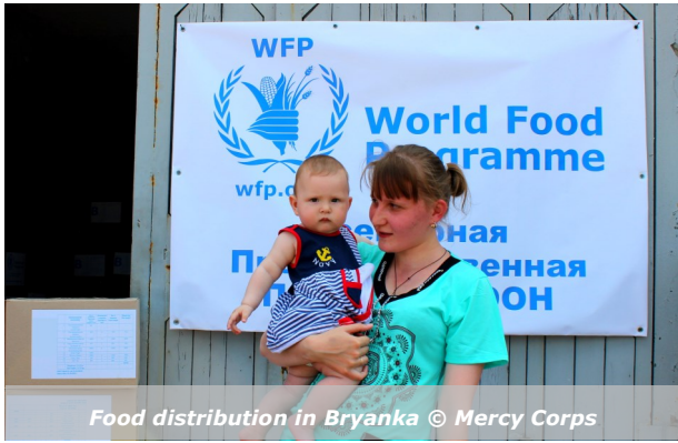
Food distribution in Bryanka