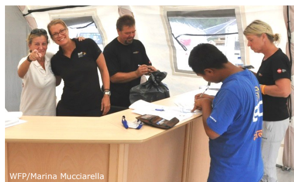
Humanitarian workers sign in at the IHP Camp in Chautara.

When the time comes to dismantle the camps, WFP has planned for restoration