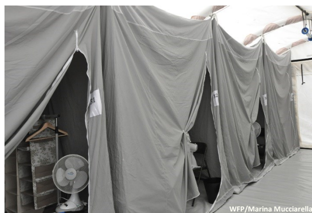
Sleeping quarters for humanitarian staff in the Charikot camp. Each tent can sleep up to seven people.