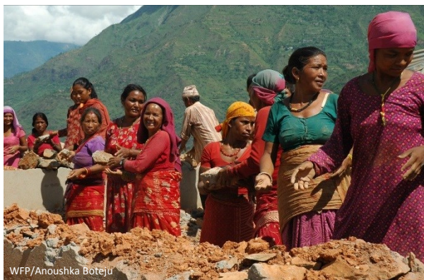
Clearing debris as part of the cash for assets programme in Sindhuli district. The programme will expand to a further seven districts over the coming months.