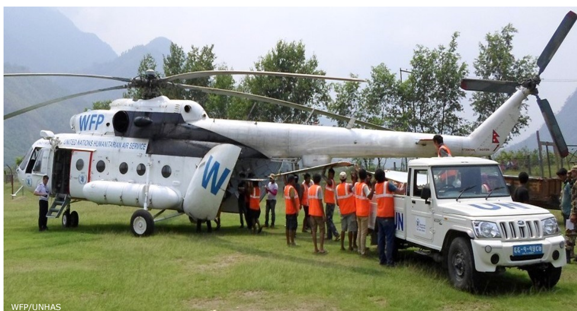
WFP/UNHAS WFP-managed UNHAS aviation service is facing severe operational challenges throughout this monsoon season. However, with area-experienced crew and close monitoring systems, UNHAS has been able to deliver over 1,185 mt of cargo to some of Nepal's hardest to reach areas.