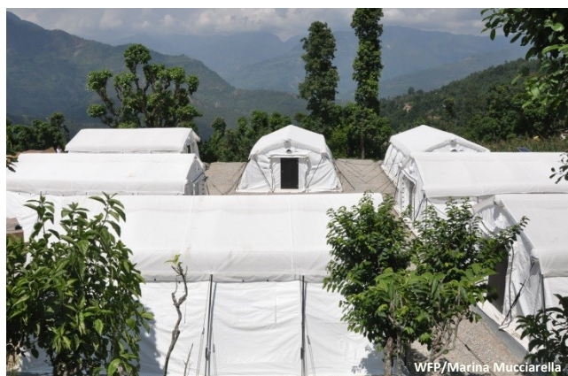
The camp in Chautara, which hosts up to 42 humanitarian workers.

The residential camps will be open until September and have so far hosted humanitarian workers from WFP, UNDSS, UNDP, UNICEF, OCHA, IOM, Plan International, Save the Children, USAID, DFID and local NGOs.