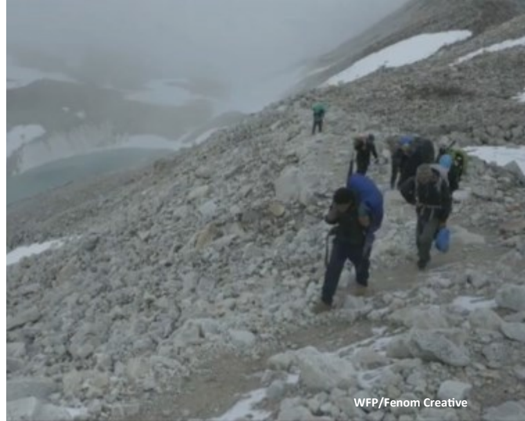
WFP's RAO has provided employment to 14,570 people to carry humanitarian cargo to some of the hardest to reach earthquake-affected areas rehabilitate trekking and community trails.

country. After more than 900 health facilities were either destroyed or damaged, WFP has mobilised its logistical, operational and engineering expertise to transport and construct these temporary clinics.