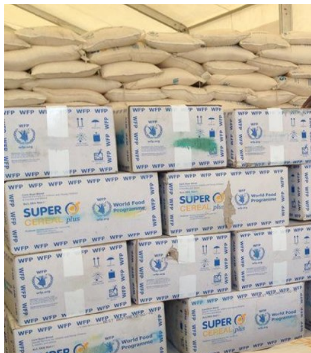
WFP Rub-hall at Mahama camp, Rwanda.

The “most likely” scenario in the revised Burundi Regional Response Plan projects the arrival of 20,000 refugees into Uganda until the end of 2015.