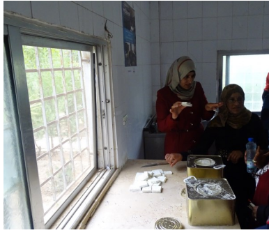
component Photo: Jordanian women training in dairy production