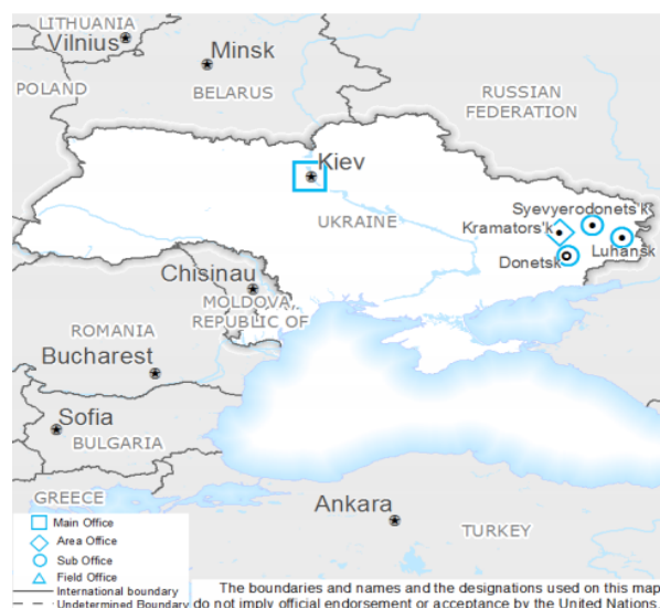
EMOP 200765: Emergency assistance to civilians affected by the conflict in eastern Ukraine

*Figures include projected requirements for the new proposed PRRO starting in January 2017.