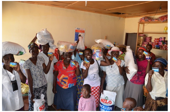
WFP Zimbabwe Smart Card Distribution in Progress