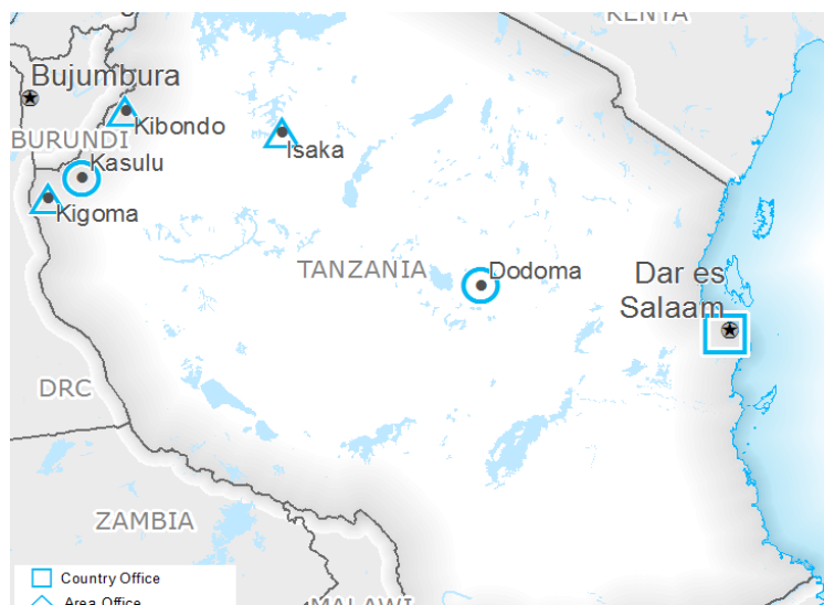
Tanzania: Emergency Food Assistance to Burundian Refugees