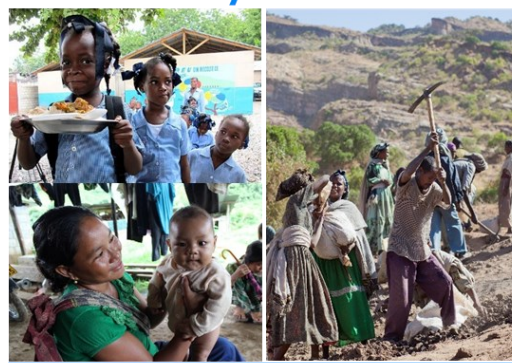
Building resilience through complementary programmes