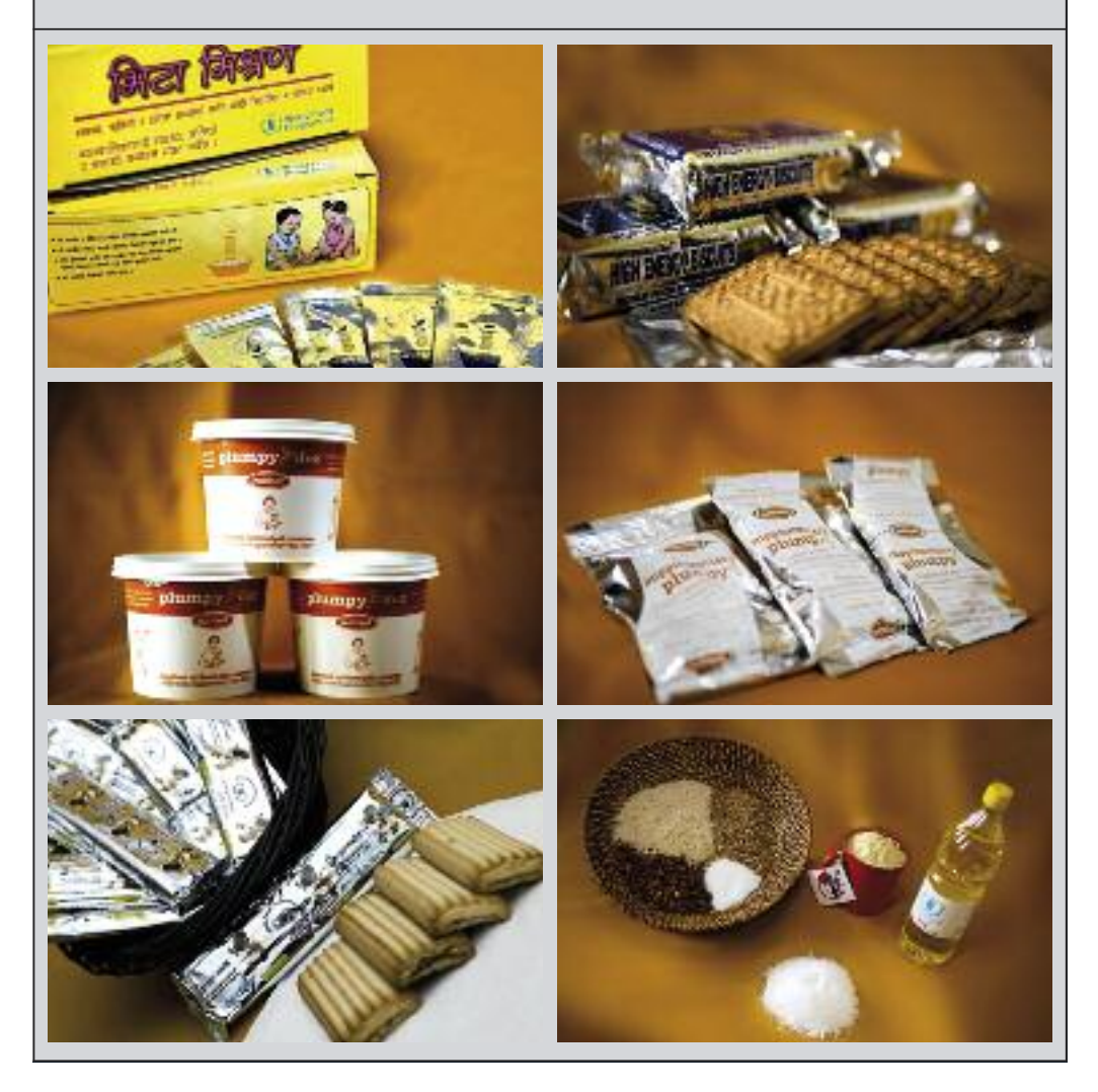
Figure 11.3 Nutritional products used by WFP

From top-left: micronutrient powder (sprinkles), high energy biscuits, Plumpy Doz^{TM} , Supplementary Plumpy ^{TM} , date-bars, and the key components of the WFP food basket.