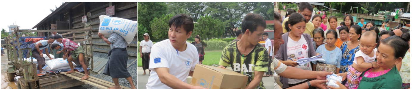
Distributions of UK funded biscuits and EU funded rice in Sagaing