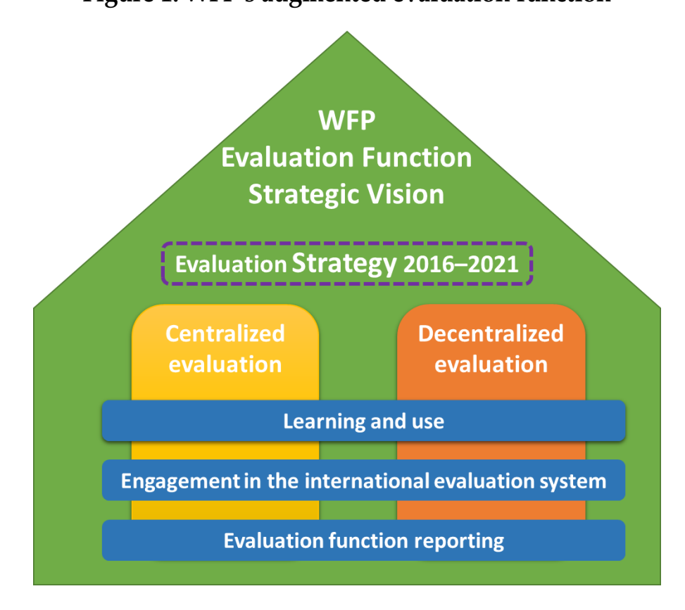
Figure 1: WFP's augmented evaluation function