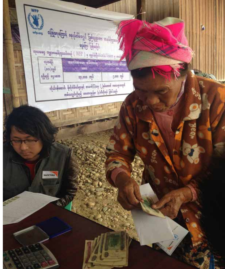
A displaced women collecting cash assistance from World Vision and WFP in Thagara Lisu Camp, Kachin State, Myanmar.

WFP partners with more than 1,000 community-based organizations worldwide. Many of them have a faith-inspired mission. This illustrative list of joint activities demonstrates the diversity of partnerships that WFP has developed with various types of faith groups across different regions, hunger contexts, programme activities and transfer modalities. The stories also reveal the mutual benefits of collaboration between faith-inspired organizations and WFP and the complementarity among local, national and international partners. Such partnerships and complementarities enable us to jointly mobilize the necessary attention and resources to save lives and build the resilience of people and communities.