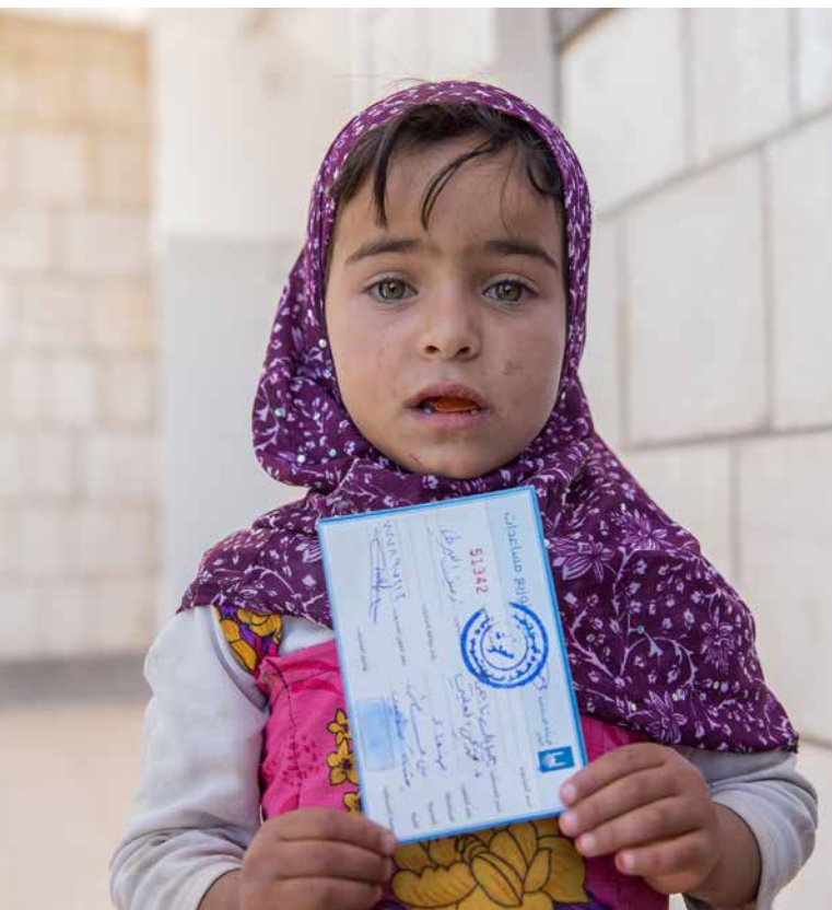
A girl with a coupon from an Islamic Relief and WFP emergency food assistance project in Sana’a, Yemen.

In North Eastern Kenya, Islamic Relief supports the Department of Health in Wajir and Mandera counties manage cases of acute malnutrition, while WFP provides specialized nutritious foods. WFP and Islamic Relief collaborate on home fortification with multiple micronutrient powders targeting children 6–23 months. This programme puts technology into the hands of caregivers, empowering them to improve the quality of their children’s diet by adding micronutrients to the locally available foods they prepare at home just before feeding their child. Islamic Relief also supports the locally-recruited community health volunteers who are instrumental in the screening process at community level and in promoting infant and young child nutrition during community dialogue days.