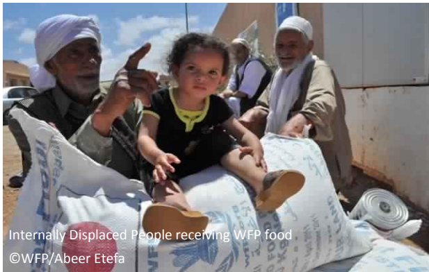
Internally Displaced People receiving WFP food