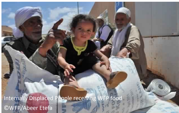
Internally Displaced People receiving WFP food