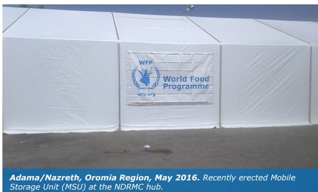
Adama/Nazareth, Oromia Region, May 2016. Recently erected Mobile Storage Unit (MSU) at the NDRMC hub.