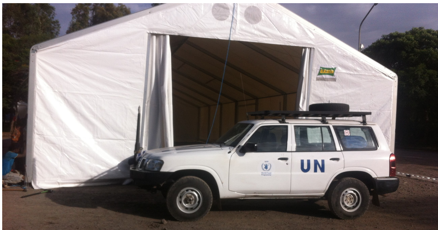
WFP vehicle and one of five Mobile Storage Units (MSUs) erected at the NDRMC Adama/Nazareth Hub by the Logistics Cluster as part of the NDRMC Storage Augmentation Plan.