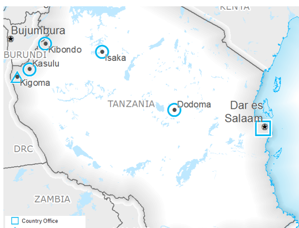
Tanzania: Emergency Food Assistance to Burundian Refugees