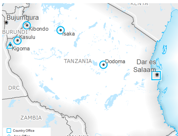
Tanzania: Emergency Food Assistance to Burundian Refugees