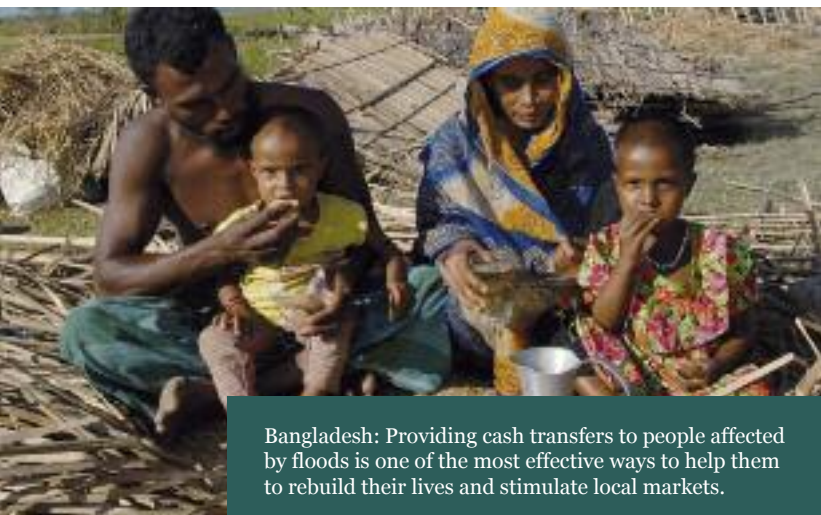
Bangladesh: Providing cash transfers to people affected by floods is one of the most effective ways to help them to rebuild their lives and stimulate local markets.

Regional level activities – WFP is closely working with regional institutions to support the development of broad coordination and policy frameworks in the common effort to fight the effects of climate change on hunger and undernutrition. In Africa, for instance, WFP is closely working with the African Union Commission, the New Partnership for Africa's Development (NEPAD), and other regional institutions such as the Permanent Inter-State Committee for Drought Control in the Sahel (CILSS) to enhance livelihood risk analysis, vulnerability mapping and food security monitoring systems and capacities.