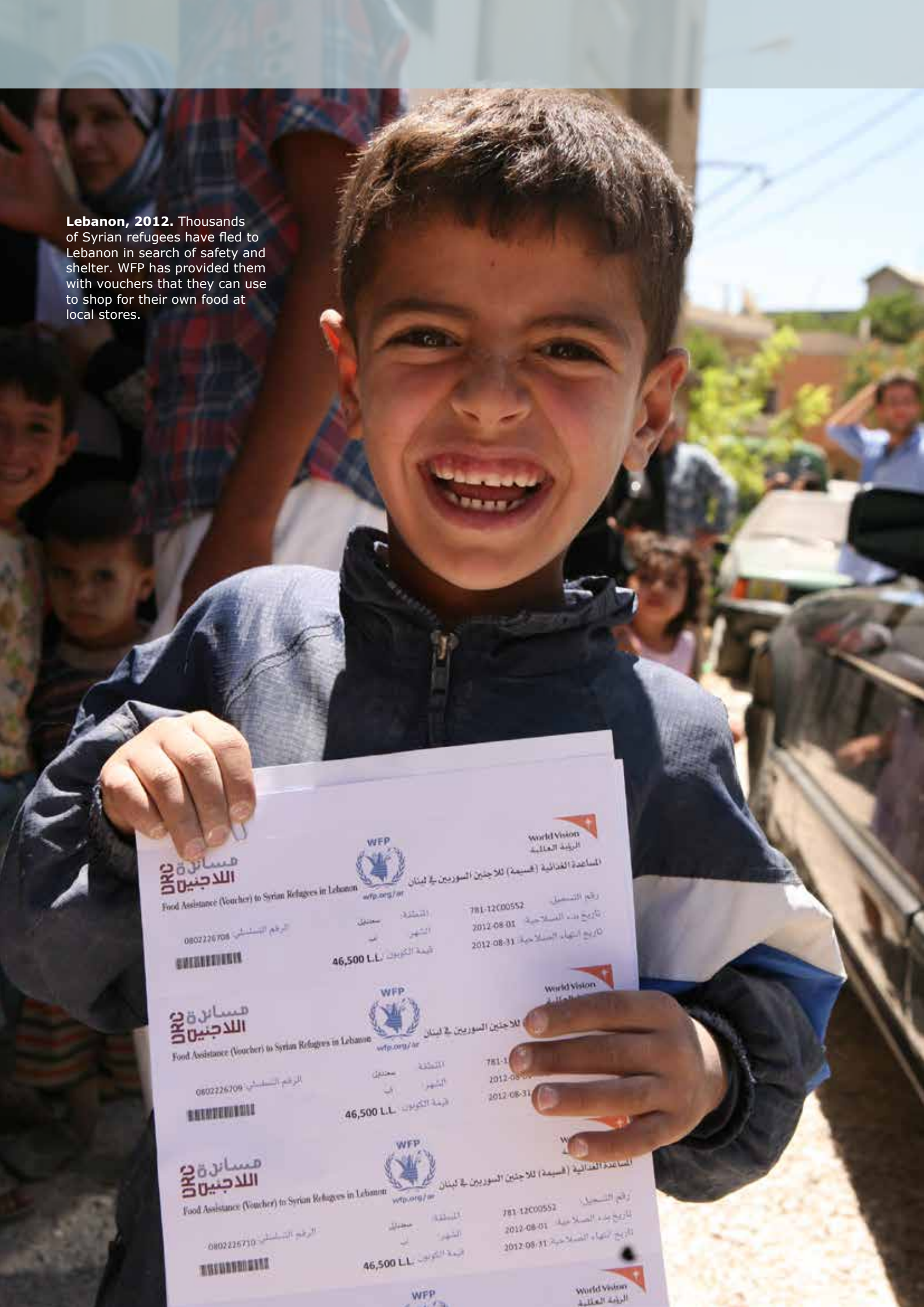
Lebanon, 2012. Thousands of Syrian refugees have fled to Lebanon in search of safety and shelter. WFP has provided them with vouchers that they can use to shop for their own food at local stores.