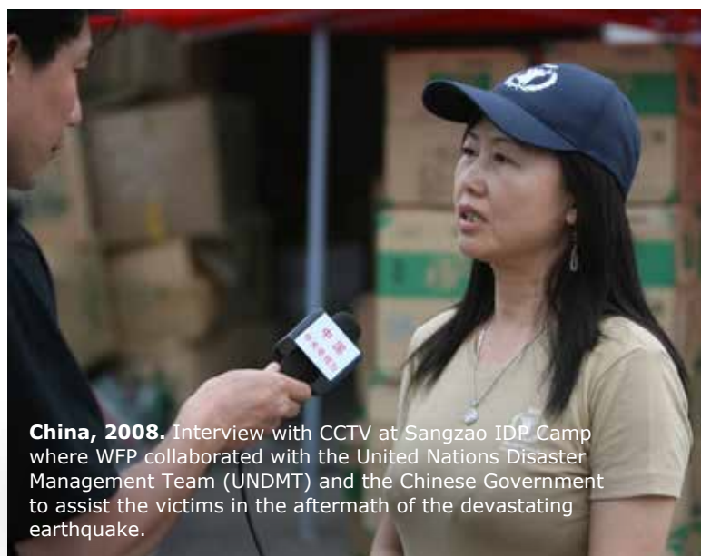
China, 2008. Interview with CCTV at Sangzao IDP Camp where WFP collaborated with the United Nations Disaster Management Team (UNDMT) and the Chinese Government to assist the victims in the aftermath of the devastating earthquake.

59. Editorial independence requires media organizations to maintain a distance and precludes opportunities for genuine partnership. However, the quality of the relationships WFP builds with media organizations can significantly improve WFP's ability to generate support and mobilize resources. WFP actively engages with traditional and digital media organizations through dedicated staff in its offices and public information officers in donor capitals and the field. Media engagement brings value by raising awareness about WFP's work, giving visibility to our strategic priorities, and supporting our efforts to mobilize funds by raising the profile of shortfalls and resource requirements, particularly in response to sudden on-set emergencies.