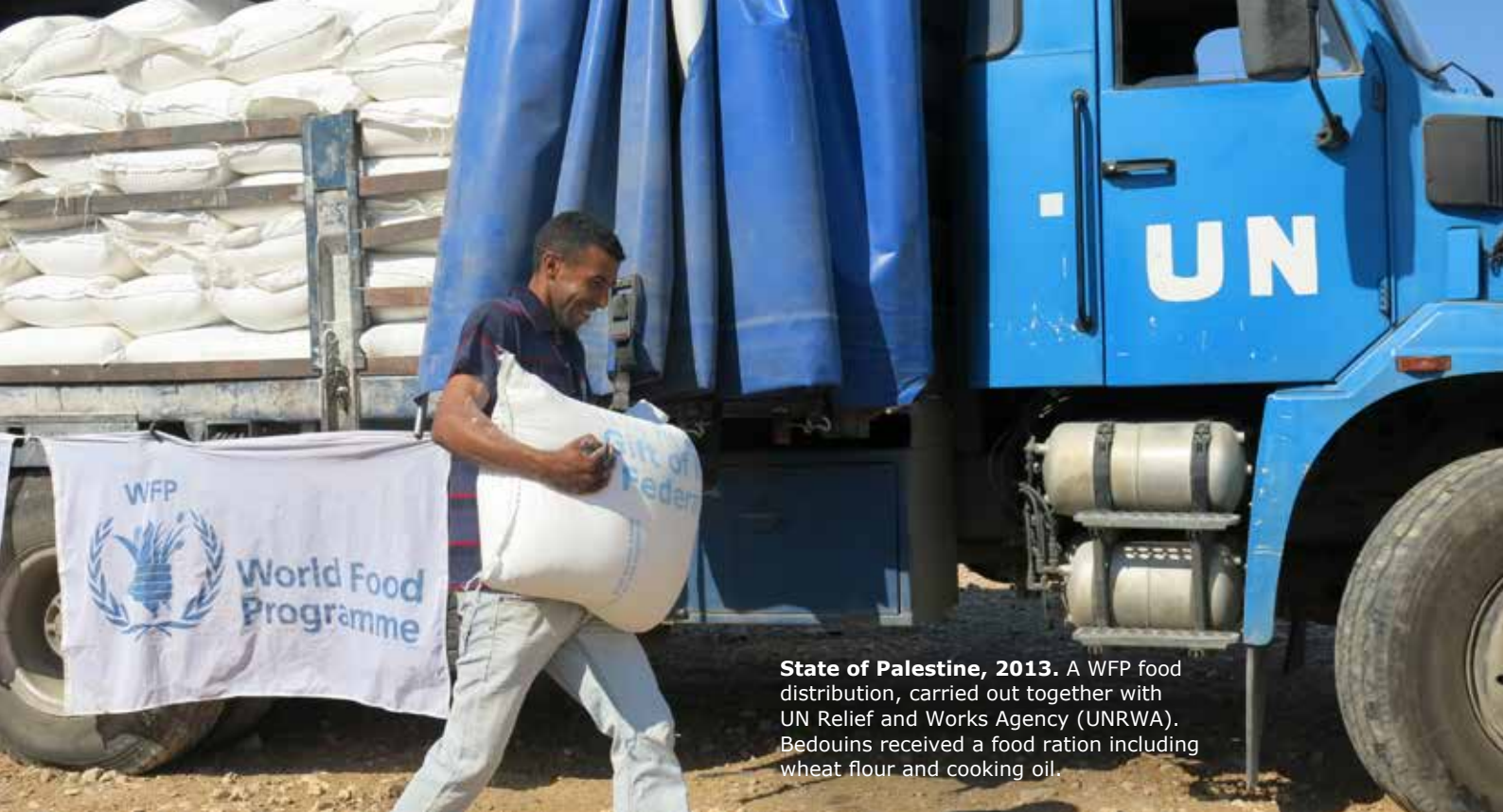
State of Palestine, 2013. A WFP food distribution, carried out together with UN Relief and Works Agency (UNRWA). Bedouins received a food ration including wheat flour and cooking oil.