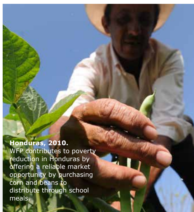
Honduras, 2010. WFP contributes to poverty reduction in Honduras by offering a reliable market opportunity by purchasing corn and beans to distribute through school meals.