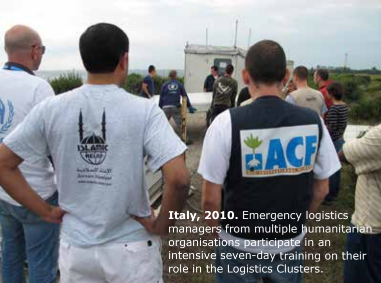
Italy, 2010. Emergency logistics managers from multiple humanitarian organisations participate in an intensive seven-day training on their role in the Logistics Clusters.