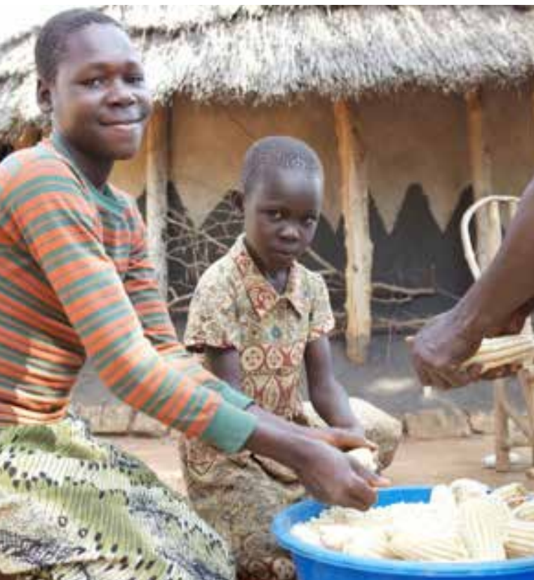
South Sudan, 2011. WFP is committed to supporting all returnees to South Sudan. This family sold 400kg of maize to WFP this year, which gave them money to cover school fees as well as to invest in an ox plough for the next harvest season.