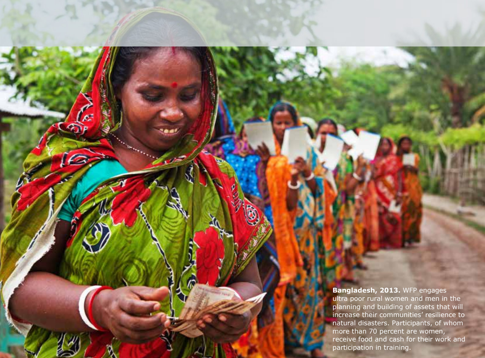
Bangladesh, 2013. WFP engages ultra poor rural women and men in the planning and building of assets that will increase their communities' resilience to natural disasters. Participants, of whom more than 70 percent are women, receive food and cash for their work and participation in training.

Key features of WFP's partnership strategy include: