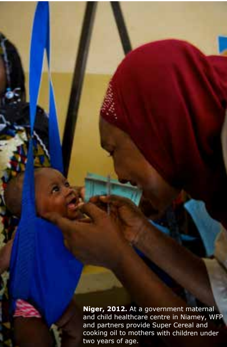
Niger, 2012. At a government maternal and child healthcare centre in Niamey, WFP and partners provide Super Cereal and cooking oil to mothers with children under two years of age.