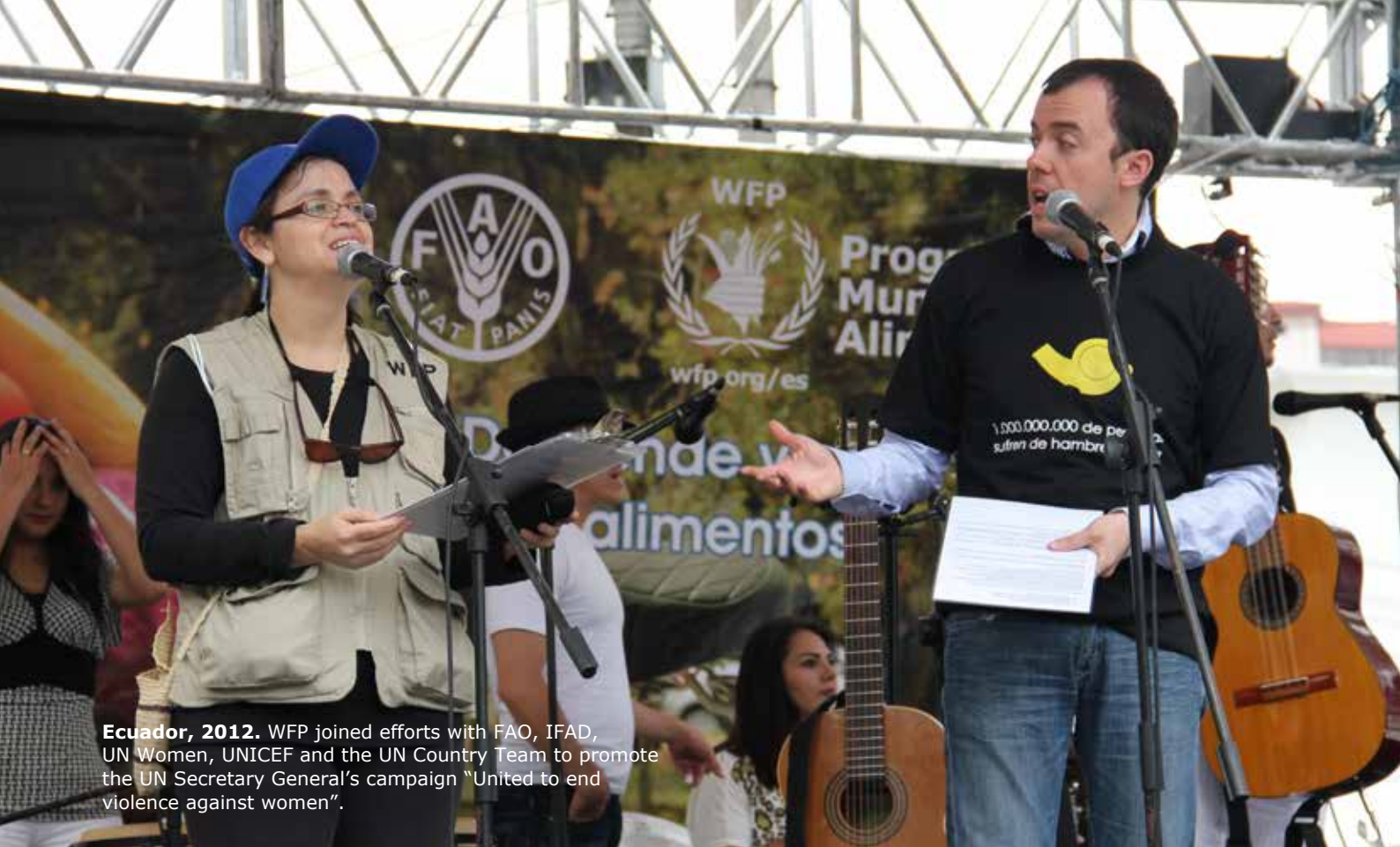
Ecuador, 2012. WFP joined efforts with FAO, IFAD, UN Women, UNICEF and the UN Country Team to promote the UN Secretary General’s campaign “United to end violence against women”.

MOU and nominated individuals in both organizations responsible for managing the relationship, keeping the MOU up to date and resolving issues and tensions that arise.