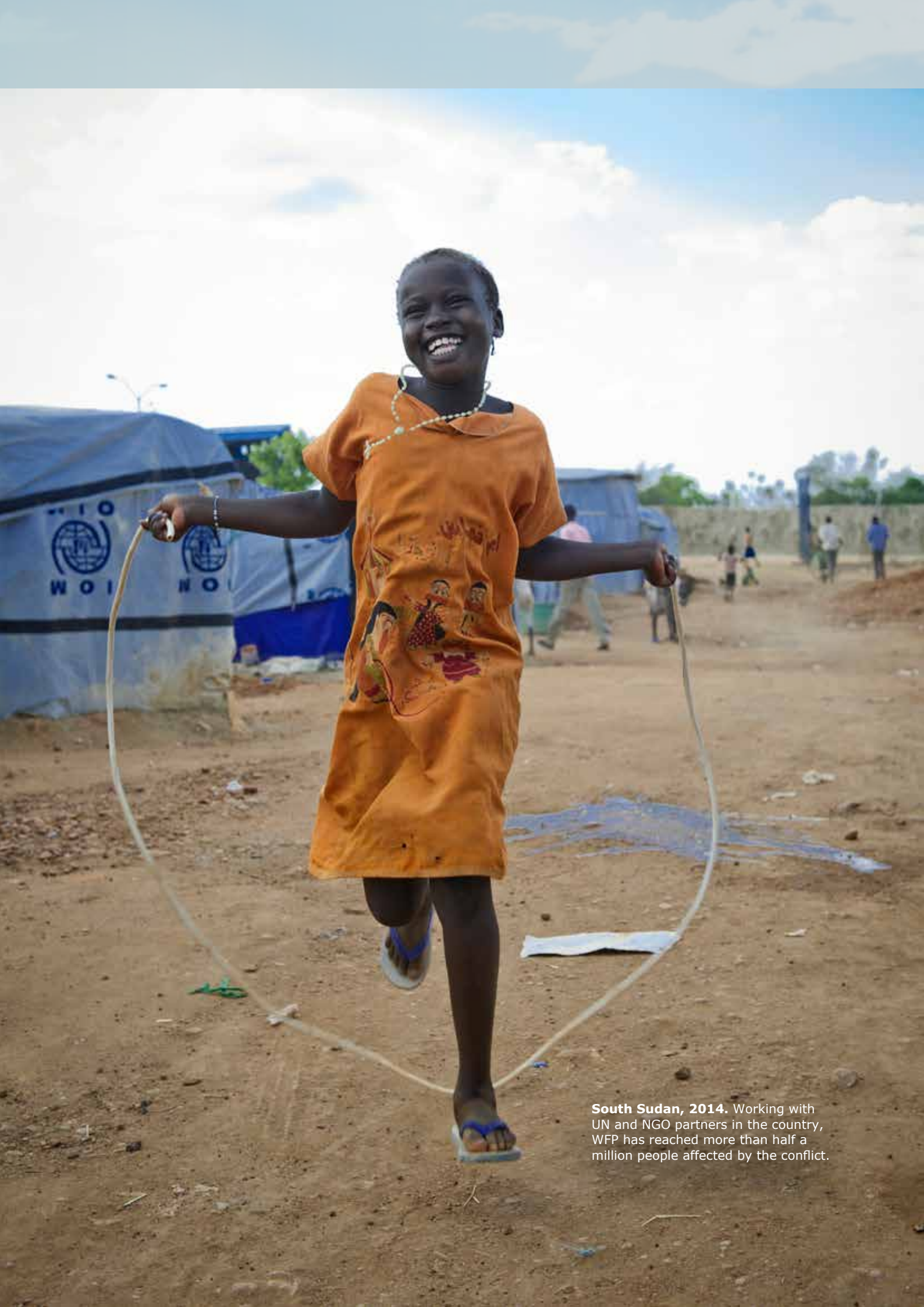
South Sudan, 2014. Working with UN and NGO partners in the country, WFP has reached more than half a million people affected by the conflict.