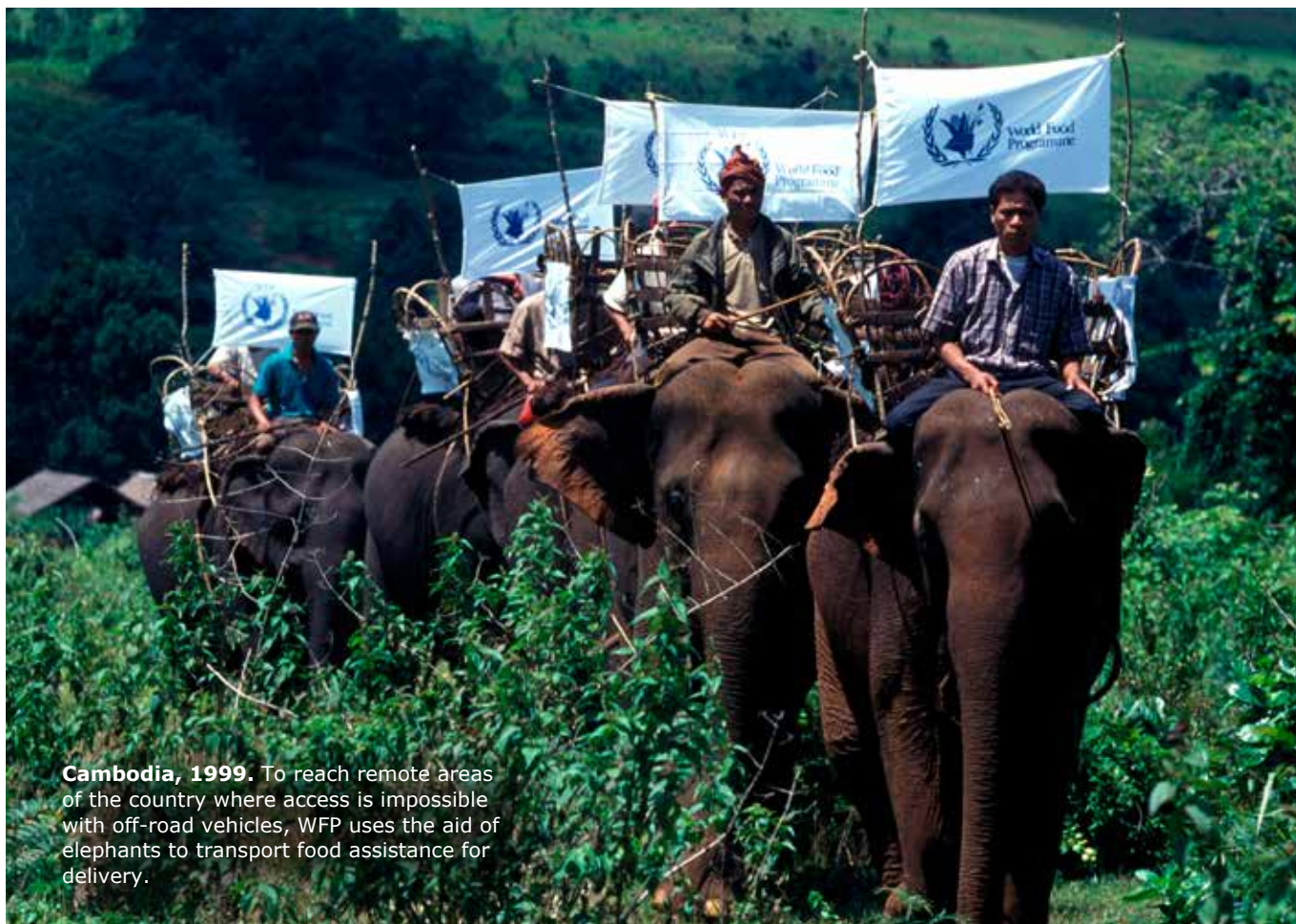
Cambodia, 1999. To reach remote areas of the country where access is impossible with off-road vehicles, WFP uses the aid of elephants to transport food assistance for delivery.