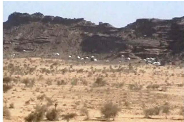
Scattered IDPs in Sa'ada

According to ICRC, there are 800 IDP families in Baqim district near the border of Saudi Arabia, which is about 90 km to the North of Sa'ada city. One of the ICRC people had gone to the area some time back and could assist and enumerate the needs of 560 families. ICRC attempted to send a convoy of assistance to Baqim but the convoy was attacked by some gun men.