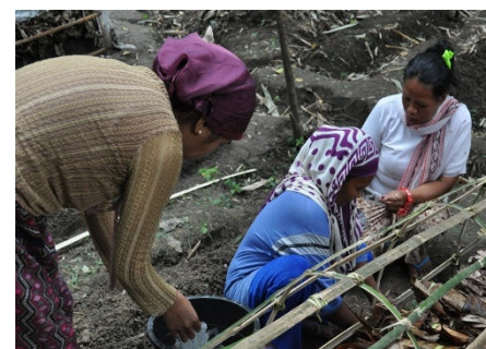
Seed Capital for Women: The project provided small seed capital to women for the establishment of livelihood activities

Similarly, the new beneficiaries will be trained on the effective and efficient use of the different agriculture inputs that the project will provide. Training would also include knowledge and skill along value chain (processing of produce) and community-based disaster risk management.