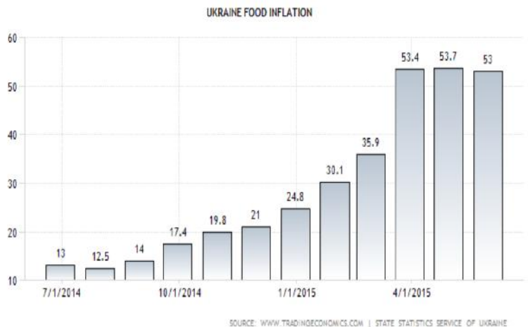
Figure 1: National Food Price Inflation Data

Recovery in Ukraine is forecast as slow, due to the on-going financial crisis and conflict in the East.