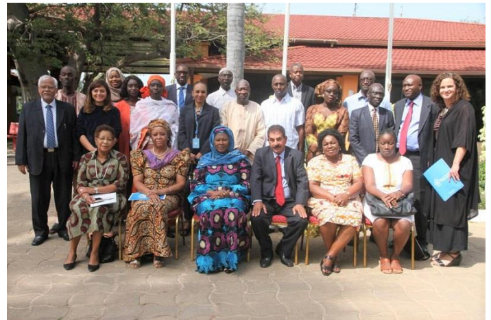
Caption: Zero Hunger Advisory Board (Chaired by the Vice President; at centre in blue) meets to Validate Report

A joint WFP, FAO and UNICEF programme, funded by the European Union, aims to ensure positive nutrition outcomes targeting particularly vulnerable households where children are most at risk from malnutrition. The focus of the interventions by the three agencies target the first 1,000 days of a baby's life. USD 11.5 million funding has been allocated for the activities under the joint programme. Activities will be implemented jointly with relevant government counterparts and NGOs.