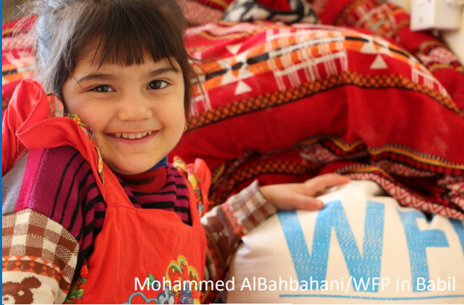
Mohammed AlBahbahani/WFP in Babil