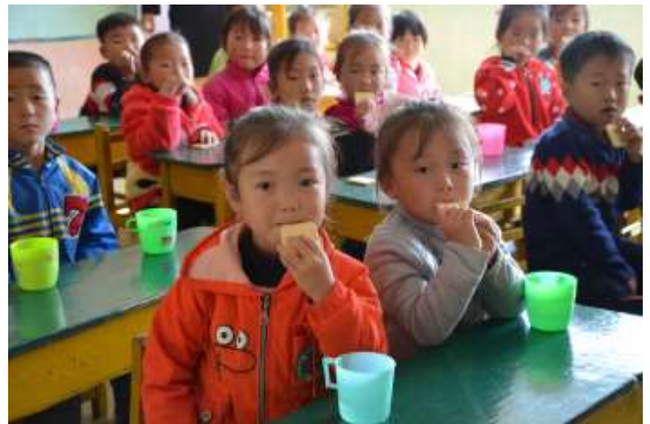
Caption: Children in a kindergarten in South Hamngyong province. WFP aims to reach 550,000 children every month through the nutrition support programme with a provision of fortified cereals and biscuits produced at WFP-supported local factories, and containing important micronutrients, fats and proteins crucial for their healthy growth.

WFP’s operation contributes to Sustainable Development Goal (SDG) 2 - Zero Hunger, SDG 17 – partnerships, and to the outcomes of the United Nations Strategic Framework for DPRK (2017-2021). It also addresses the needs and priorities of the Humanitarian Country Team in DPR Korea.