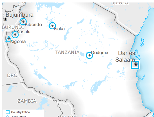
Tanzania: Emergency Food Assistance to Burundian Refugees