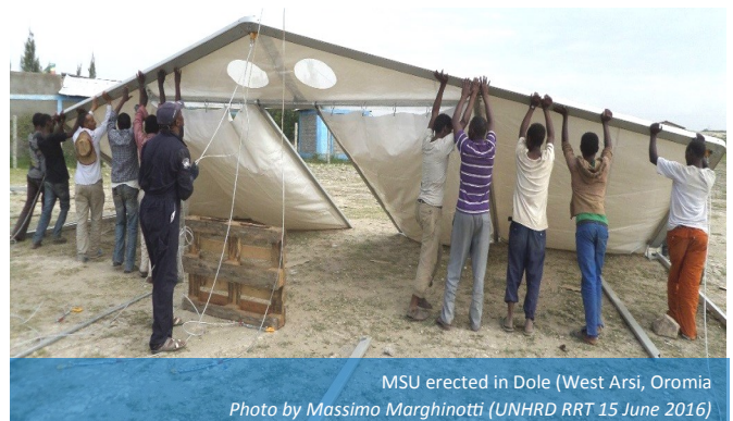
MSU erected in Dole (West Arsi, Oromia) Photo by Massimo Marghinotti (UNHRD RRT 15 June 2016)