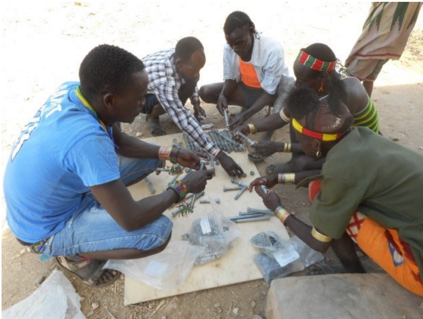
The local people from Menugelti in South Omo Zone, SNNPR, are assisting in preparing equipment to erect a Mobile Storage Unit (MSU) in the village.