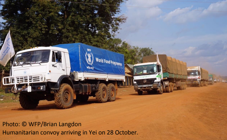
Humanitarian convoy arriving in Yei on 28 October.