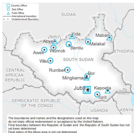
Photo: WFP Says No to Gender Based Violence is part of the UN Secretary-General’s campaign to End Violence against Women (UNiTE)