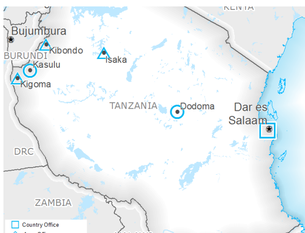
Tanzania: Emergency Food Assistance to Burundian Refugees