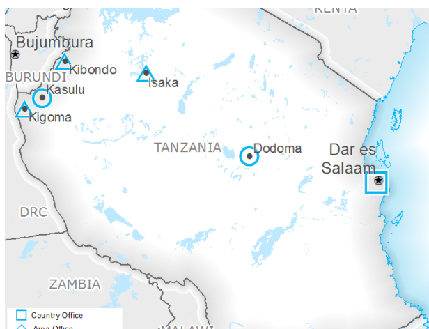
Tanzania: Emergency Food Assistance to Burundian Refugees