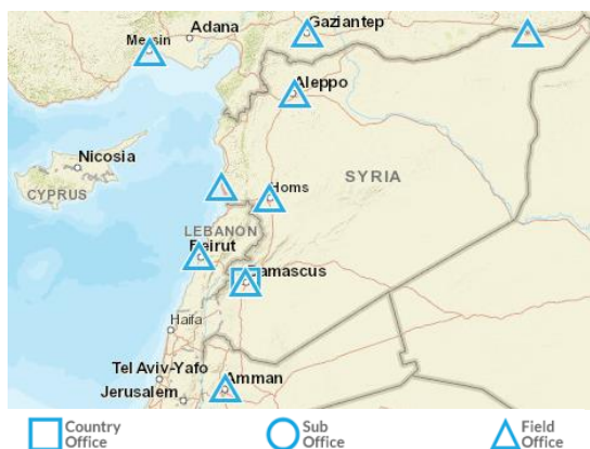
Caption: WFP is expanding its the school meals programme, and is reaching new schools in southern Syria through its cross-border operation from Jordan since October.

* Net funding requirements until the end of 2017