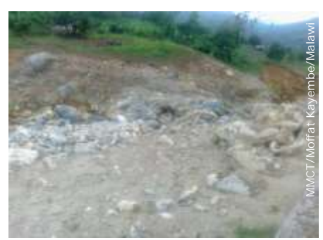
The bare Lichenya riverbank after the 2011 flash floods. This is what caused the community to participate in the WFP AAP without asking for incentives.

During the project's needs assessment meeting in Nessa (this participatory approach is at the core of the AAP programme), the village identified a focus on tree planting as a way to prevent flooding in the future. However, WFP and partners complemented this with a package of interventions to optimize impact, and provide livelihood and economic opportunities to add to the village's motivation. A total of 300 households, out of 1,000 households in the area participated in the project, which was implemented through the Village Committee (VC) at the village level.