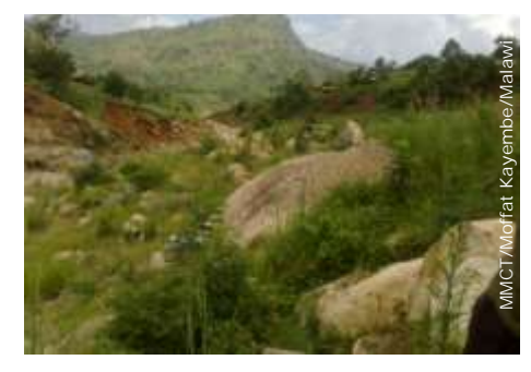
Landscape change with vertiver grass and tress planted along the Lichenya riverbank by December 2012

Capacity building includes training on project management, roles and responsibilities. It involves training of trainers on permaculture design, agro-forestry technology and tree planting techniques.